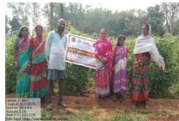
Bitter Gourd Staking Method