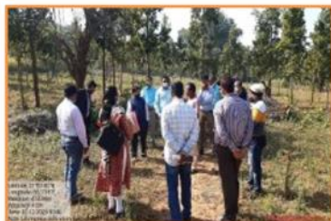
Agro Forestry & Field visited by Special Secretary to Govt. & Covid Commissioner