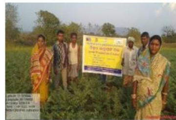
Chickpea Variety BCG